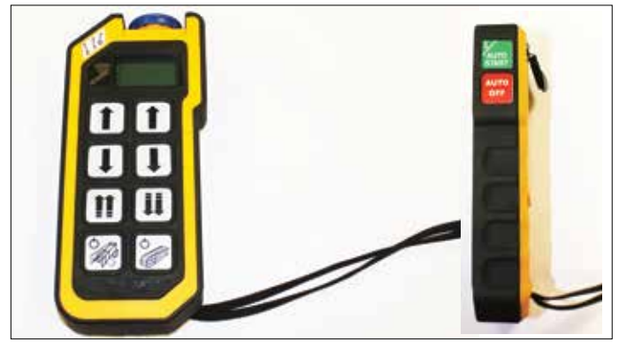
Remote Control Unit (Optional)