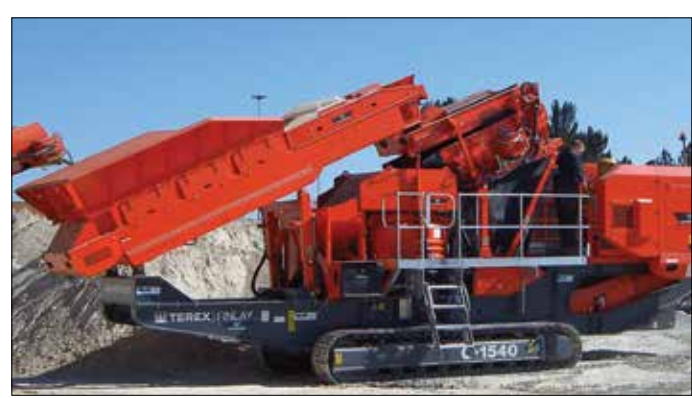
Hopper and Pre-screen