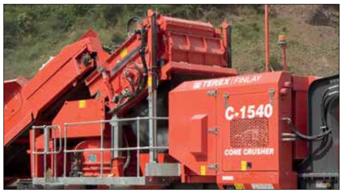
Pre-screen module in working mode