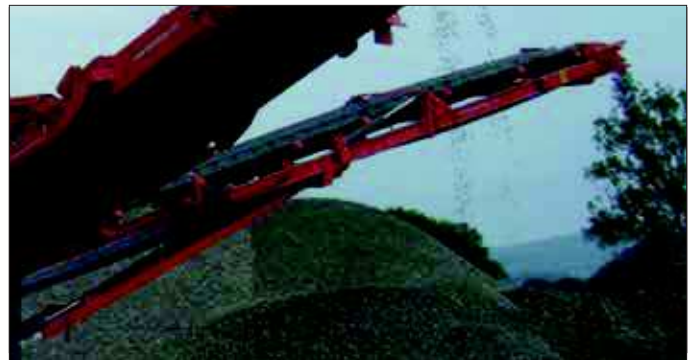
Oversize Plus Conveyor