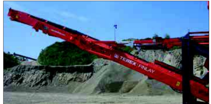
Oversize Minus Conveyor