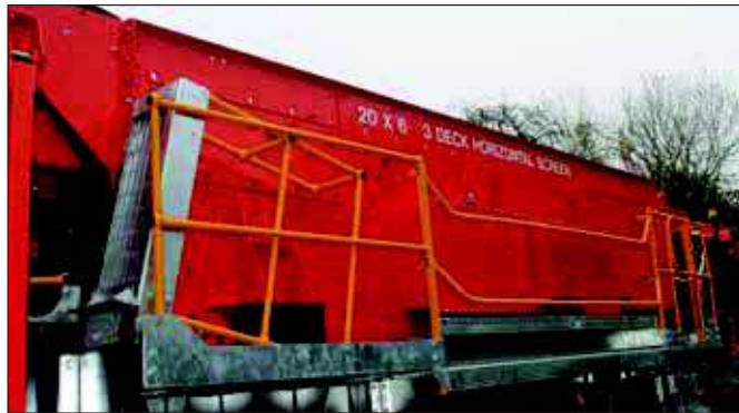
Screenbox in transport mode