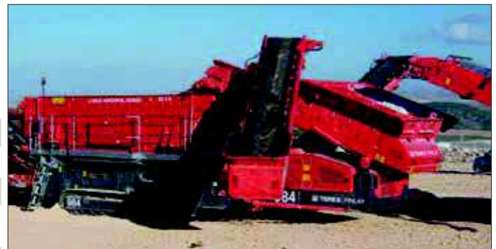
Optional - Re-Circulation conveyor. Requires 1 nr auxiliary drive