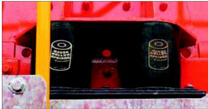
Springs: Rubber marshmallow type