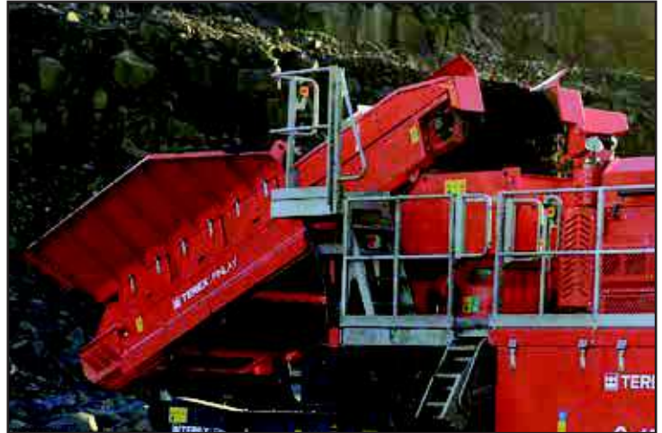
Hopper and Feeder

Dust suppression fitted at cone inlet and outlet