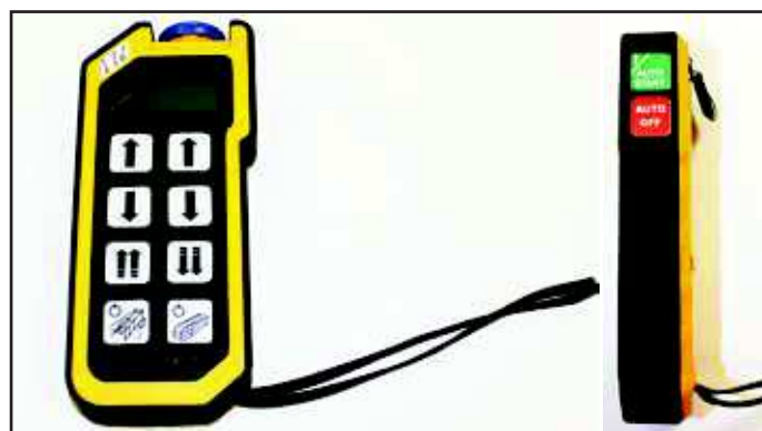
Remote Control Unit (Optional)